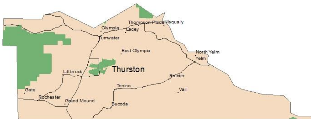
Figure 1. Olympia-Tumwater, Washington MSA

In this report, wherever the terms local or Olympia are used, they refer to the metro area—that is, all of Thurston County.